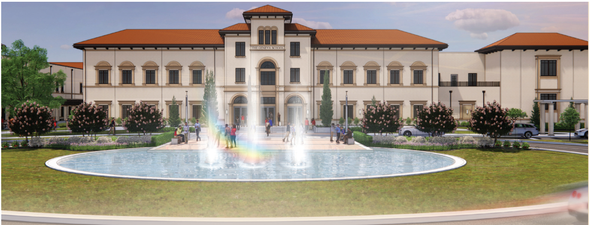
Circle Drive Rendering

From a practical standpoint, as we plan for thoughtful and intentional growth in enrollment, we can look to industry best practices to help us evaluate the need for a competition gym as well.