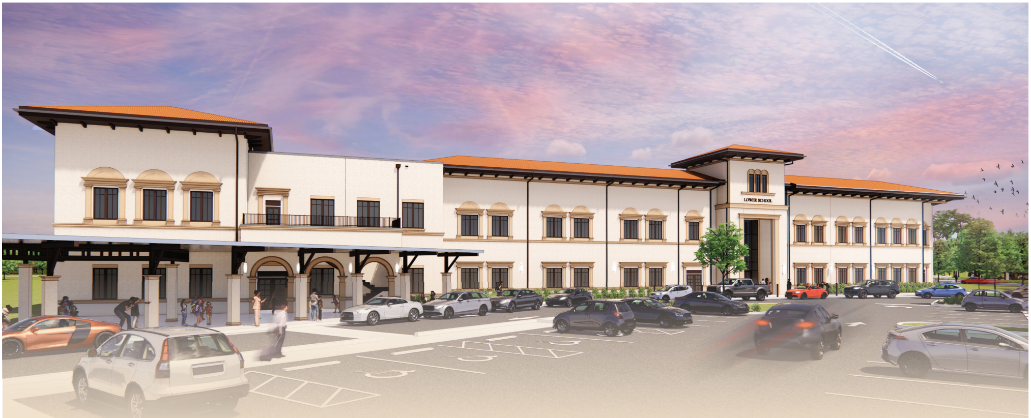
Front of Lower School Rendering

Our movement began nearly three decades ago when friends gathered to discuss the state of education in America and how they might transform it. They sowed the seeds that planted this Christian classical education that seeks to challenge and inspire both the bodies and souls of its students.