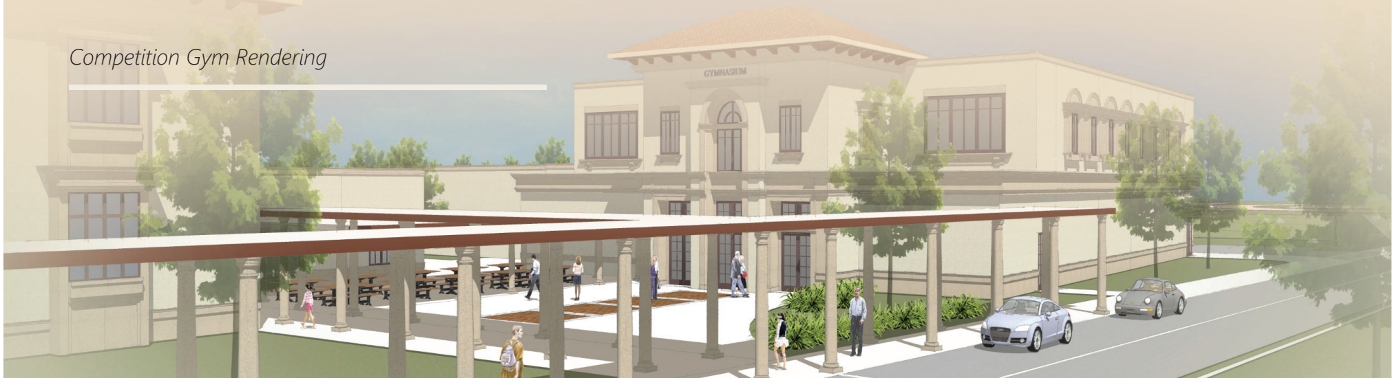
Competition Gym Rendering

This gym will serve as a battleground for wins and losses and as a place where Christian character is tested and grows in the face of challenges. This gym will provide a space where students can learn to, in the words of Isaiah, “run and not be faint.” Or in the words of Paul, “lay aside every weight, and sin which clings so closely, and ... run with endurance the race that is set before [them].” This gym will allow experiences to happen that will sharpen students’ skills for battle—in athletics and in life. This gym will provide times where the whole community can demonstrate love for your neighbor and the fruit of the spirit as we interact with teammates, officials, opposing teams, and coaches. This gym will encourage the pursuit of excellence in both talent and character. As we have said during our earlier campaigns, and we trust remains true: we shape our buildings, and thereafter, they shape us. Stories that are written in this space of battles ending in both defeat and victory will be the stories describing who we are; these will be told by students and parents alike to each other and to their children one day. I pray that all of these stories depict a pursuit of excellence and a grateful acknowledgment of giving all praise and honor due him who has given us this place.