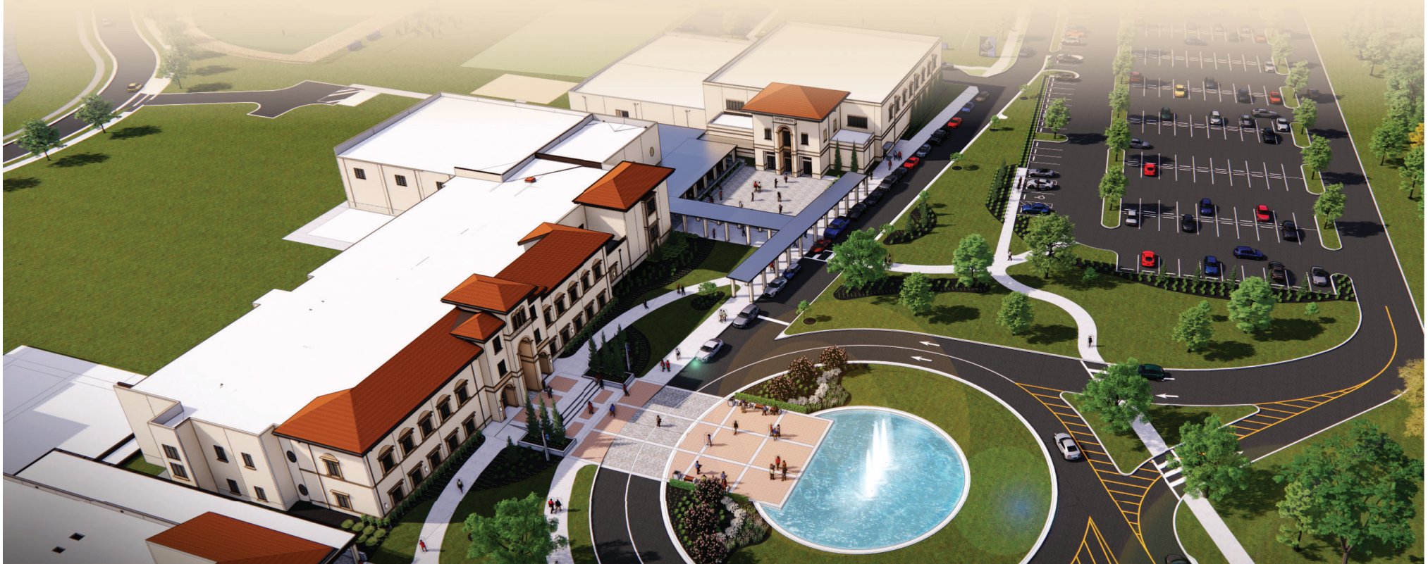
Aerial View of Upper School and Competition Gymnasium Rendering

The plan to accommodate the additional athletic practices and competitions was to rent a nearby gymnasium as we continued to raise the funding needed to build the second gymnasium.