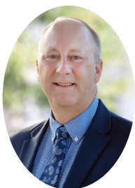
From the School President

God has done this good work through Geneva, forming these three exemplary graduates years ago and shaping students in the current student body, with the generous help and support many have given to the school for decades. Thank you for being a part of this good work.